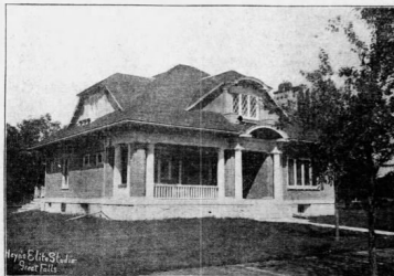
S. E. ATKINSON'S BUNGALOW.